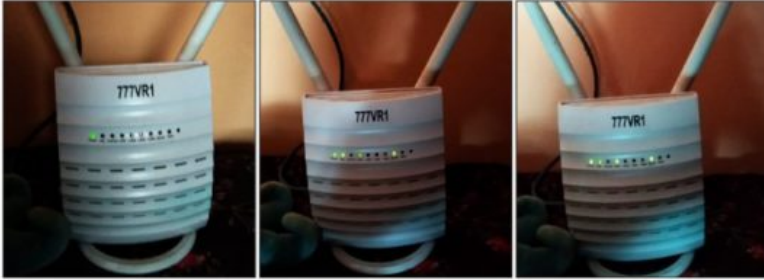
4th Jan 2021 10:35AM 4th Jan 2021 11:22AM 4th Jan 2021 2:43 PM