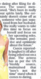
According to a US Weekly insider, Cuoco is in no rush to get back