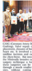
Earlier, traditional open surgery was the only option for

Just imagine a patient undergoing a heart surgery and being able to walk out of the hospital in three to four days and return to his routine professional and personal commitments in about 3 weeks. Hard to believe? Advances in cardiac bypass surgeries through Minimally Invasive technique, popularly termed as Minimally Invasive Cardiac Surgery (MINI or MICS) has made this possible. Descending technological and surgical skill advancements resulting in shorter hospital stay and quicker return to normal life is the way forward. Apollo Hospitals, Indore announced accomplishing over 250 Minimally Invasive Cardiac Surgeries (MINI) at its Vijay Nagar based Institute of Cardiac Surgery.